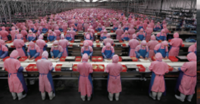
Manufacturing #17, Deda Chicken Processing Plant, Dehui City, Jilin Province, China