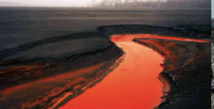
Nickel Tailings #34, Sudbury, Ontario, Canada